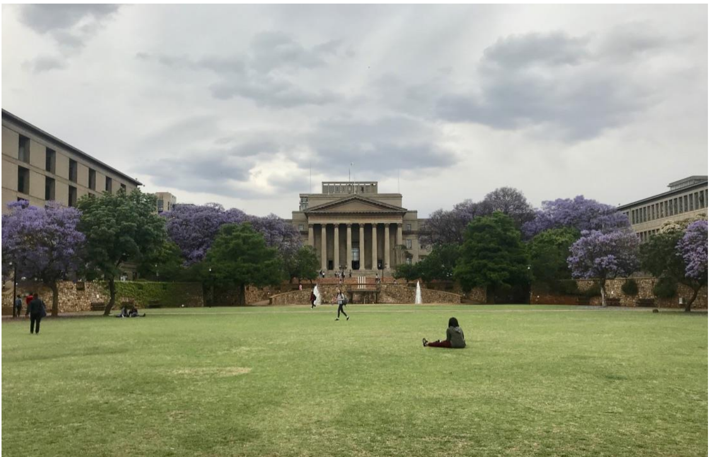
WITS Main Campus 1

My application to WITS was done through the WEX-outgoing portal of the University of Cologne and therefore worked without a problem and not only in the application process the international bureau of the WISO faculty was a great help. Some of the documents needed for the application are a motivational letter, your transcript of records and a proof of your level of English e.g. TOEFL. It is important to note, that you will need a Study VISA to go to South Africa. This VISA can be obtained at the South African Embassy in Berlin, which requires you to travel to Berlin. I actually did in a day trip by plane and used the chance to do some sightseeing in Berlin. The whole VISA-process is quite tedious as you will need to obtain quite a few documents e.g. police clearance and stamped bank statements. The Visa application should be done shortly after the admission to WITS because the process can take up to six weeks, after you hand in the documents at the embassy